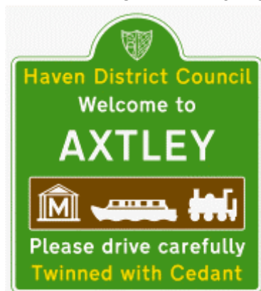
Figure E/4.5N Example of a town or village boundary sign with tourism information

NOTE The sign shown in Figure E/4.5N is a boundary sign that permits the inclusion of a brown panel displaying tourist and leisure symbols.