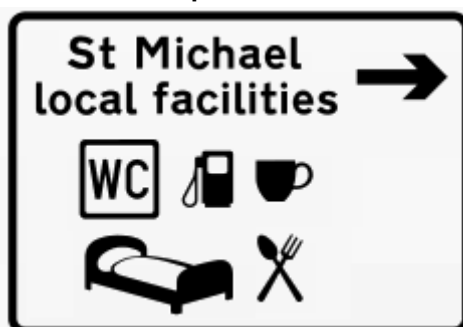
Figure E/6.5N Example of a local facilities sign

NOTE A local facilities sign is shown in Figure E/6.5N.