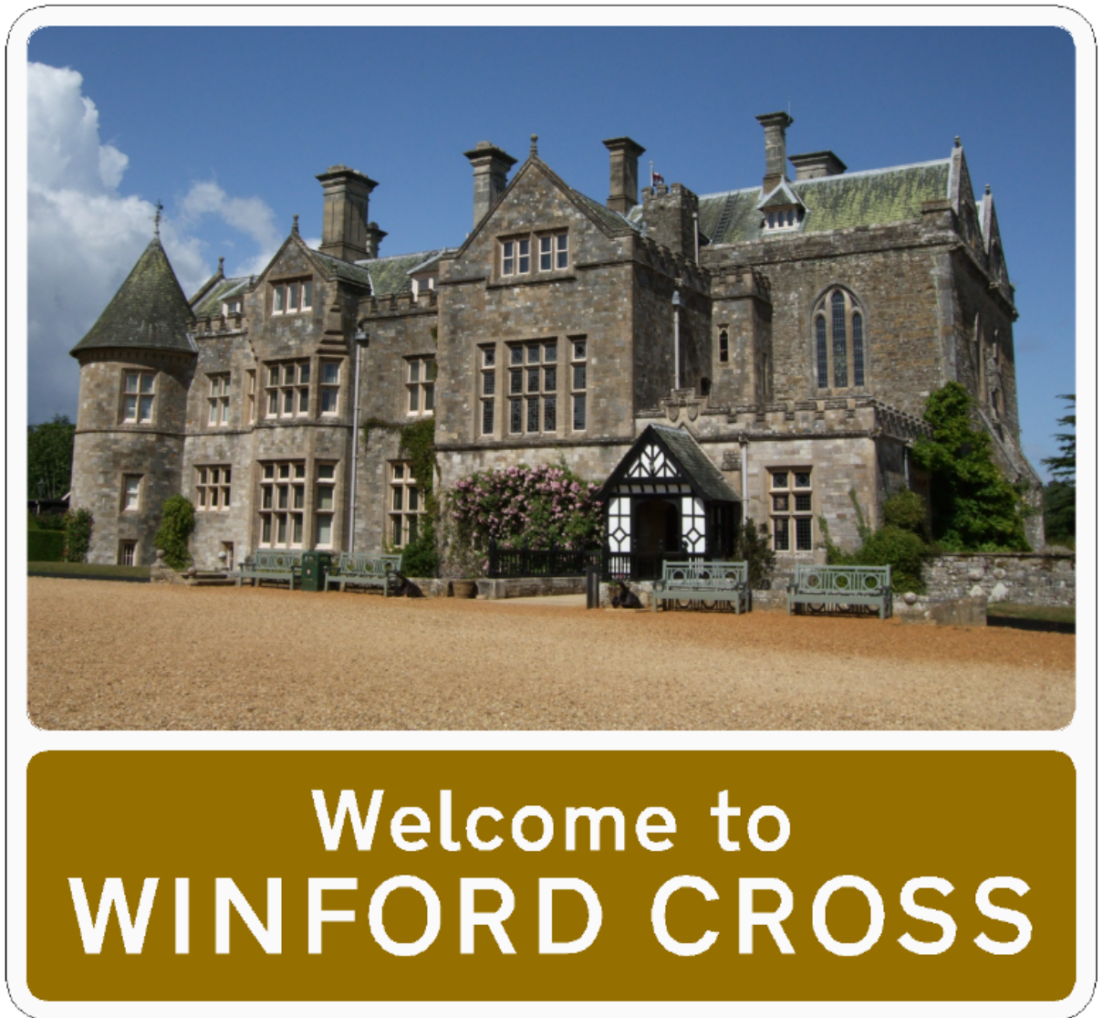
Figure E/4.6N Example of a boundary sign with an image

E/4.7 Historic county areas shall not be depicted using boundary signs with an image.