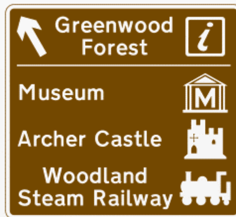
Figure E/3.4N2 Example of collective tourist signing

E/3.5 A descriptive legend shall not be shown on any part of collective signs.