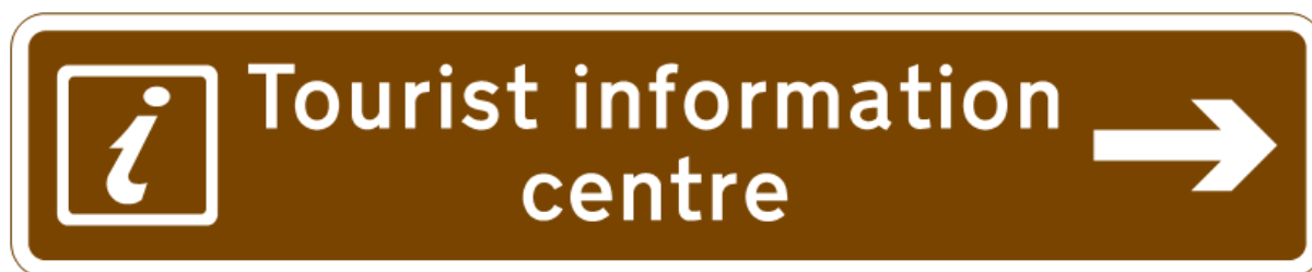
Figure E/5.3 Example of a tourist information centre sign

E/5.3 Where prescribed by TSRGD SI2016 No.362 [Ref 7.N] initial signs to TICs shall display the legend 'Tourist information centre' and the associated "i" symbol as shown in Figure E/5.3.