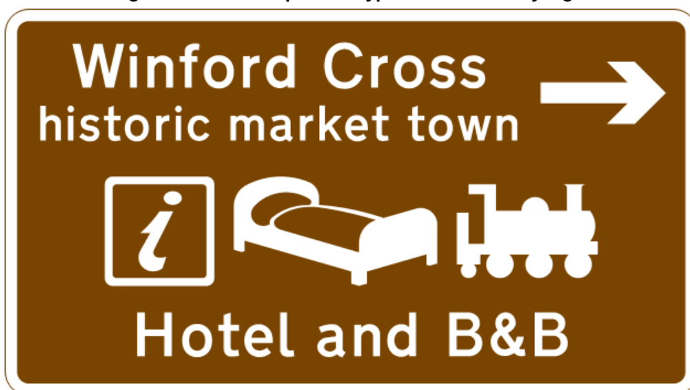
Figure E/6.1.1 Example of a bypassed community sign

E/6.2 Bypassed community signs shall not be permitted for a community that is already signed from an all-purpose trunk road.